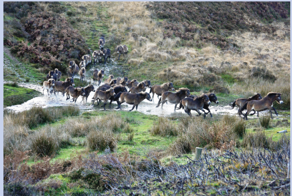
Bottom: Free-living Moorland Exmoor ponies in Exmoor National Park